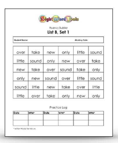
Fluency Builder Sample